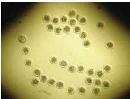
Embryos from a single flush ready for transplanting into recipient ewes

While ET programs can be accommodated in your shed on property, consideration should be given to the timing, and frequency of drug administrations and the scheduling of both donor and recipient ewes. It is usually advisable to have all the ewes, both donors and recipients, at the AI centre for this procedure. Not all ewes, donors and recipients, will respond to drug treatment, with around 25% of the ewes failing to produce any fertilized eggs, and even then, the quality of embryos from those that do produce can be variable. As with any artificial breeding technique, you achieve some outstanding results and some very poor ones with no apparent difference in preparation of ewes. However success rates are constantly improving as we learn more about all areas relating to ET from nutrition to the handling of embryos.